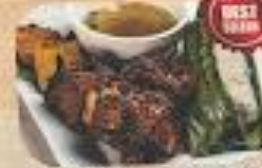
H.6. Grilled Beef Ribs Served with peanut sauce and soup Tofu Tempeh included