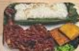
H.4. Grilled Chicken Sambal Rujak Tofu Tempeh included