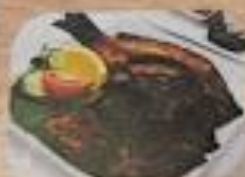
H.11. Grilled Fish (Tilapia)