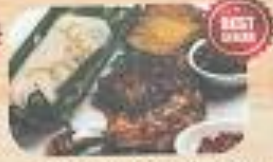
H.2. Grilled Chicken Tofu Tempeh included