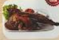
H.9. Fried Fish (Tilapia)