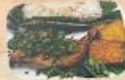
H.3. Fried Chicken Green Chilli Tofu Tempeh included