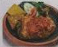
T.1. Ayam Penyet