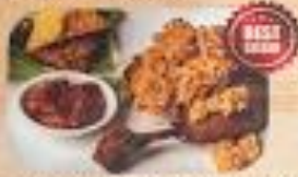
H.1. Fried Chicken Kremes Tofu Tempeh included