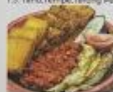
T.3. Tahu, Tempe, Terong Penyet