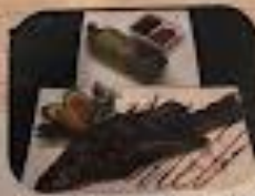
H.12. Grilled Fish (Barramundi)