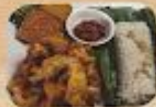
H.8. Fried Squid Tofu Tempeh included