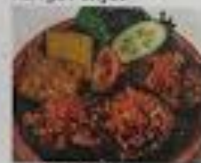
T.2. Iga Penyet