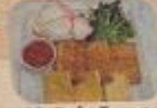
H.10. Tofu Tempeh [v]