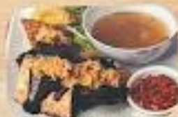
H.5. Fried Beef Ribs Tofu Tempeh included