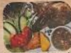
H.13. Fried Duck Surabaya Tofu Tempeh included