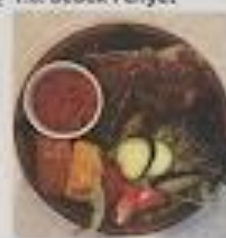
T.6. Bebek Penyet