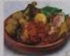
T.4. Penyet komplit