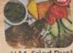
H.14. Fried Duck Green Chilli Tofu Tempeh included