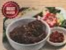
H.7. Beef Rendang